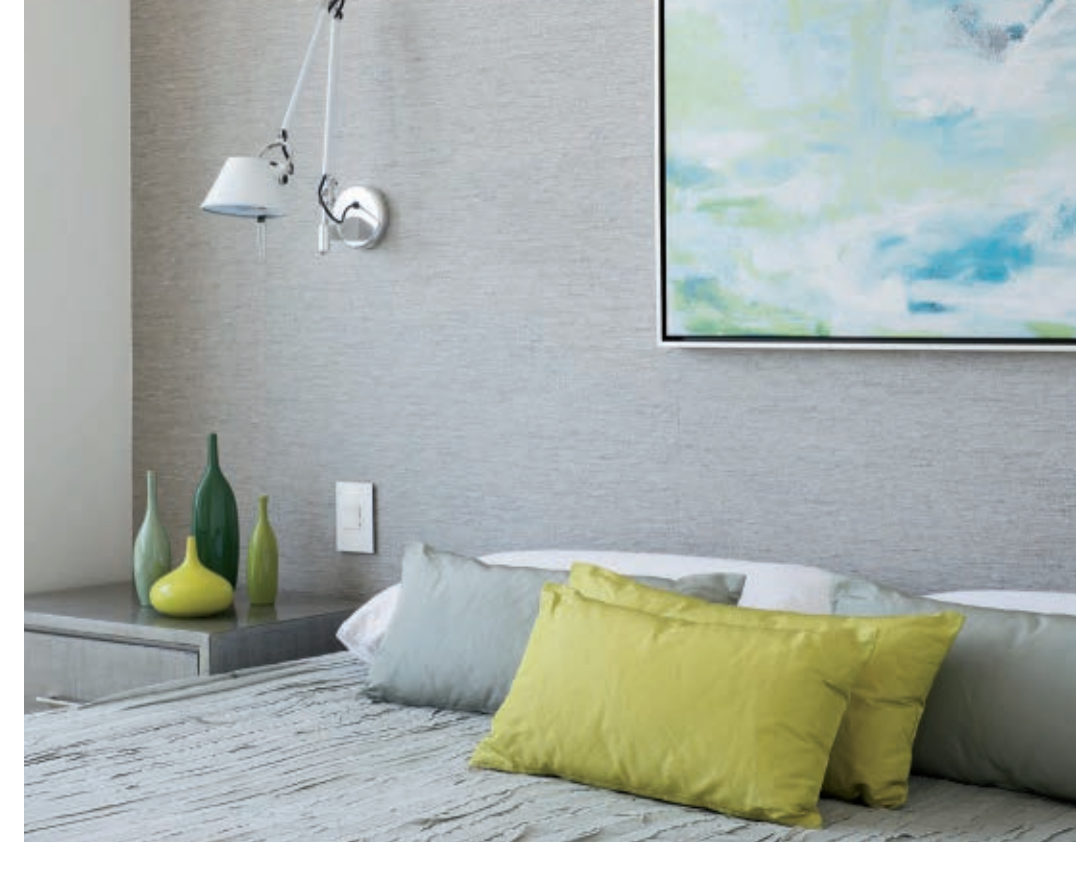
BECAUSE THERE IS no headboard, the wall behind the bed in the master bedroom needed to make a statement. Najnigier chose Intertwined, a wallcovering by Phillip Jeffries, to add the texture she craves.

The guest bedroom was to welcome the Najnigiers' sons when they visited, so it holds two full-size beds. To accommodate them, a bulky walk-in closet was replaced with a narrower wall closet that had been part of the adjacent master bedroom.